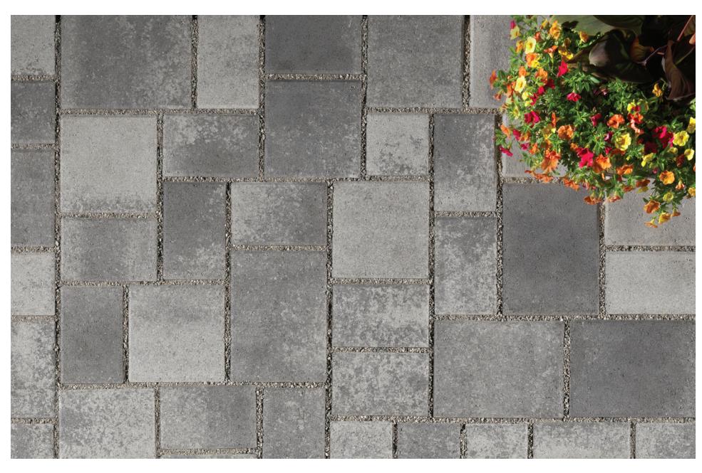
Shown: Gray-Charcoal Permeable Courtyard in an ashlar pattern.